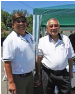
Our fabulous Judges

We had a fun time at the Young Koi Show. Thanks to everyone for all their hard work and congrats to the winners!